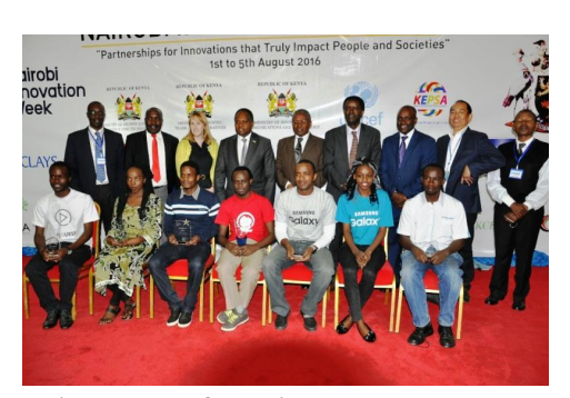
Winners pose for a picture