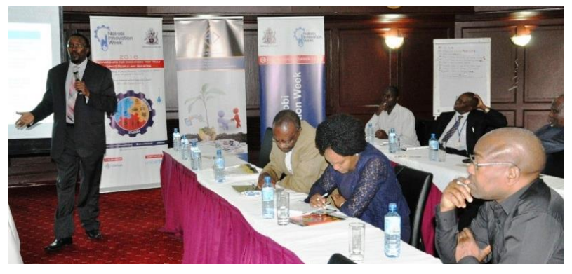
Commercializing Innovations Seminar during Innovation Week