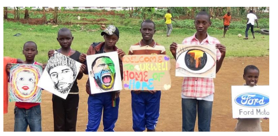
Children from Ukweli Children Rasarani show-off their paintings which were facilitated by a donation of paints and paintbrushes from Entrepreneurial Action Us (ENACTUS) student organization.