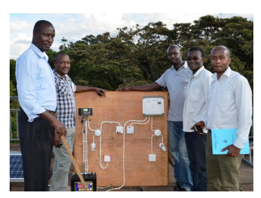
Renewable Energy has become a new frontier in business. The Physics department has been working tirelessly to ensure that Kenya has the capacity to meet the challenges that will be faced in meeting the growing demand for this product. To this end, the department regularly holds training for technicians to be able to support the industry